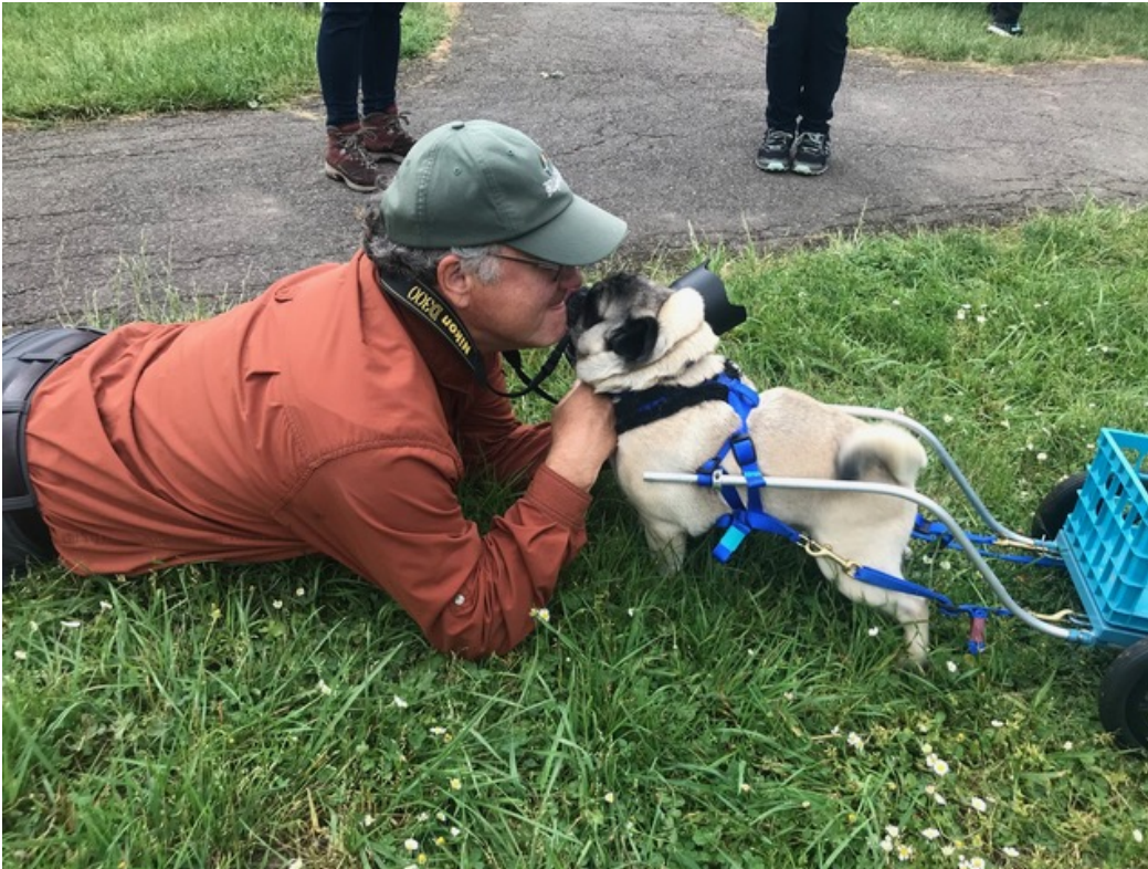
Hamming it up with one of the photographers.