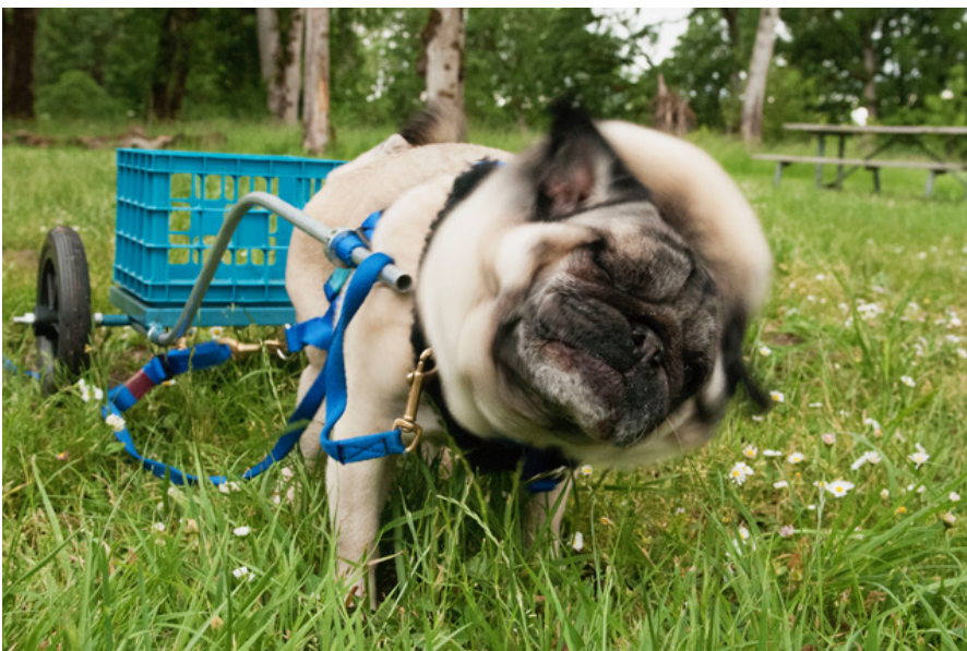
Sampson, after passing the test.