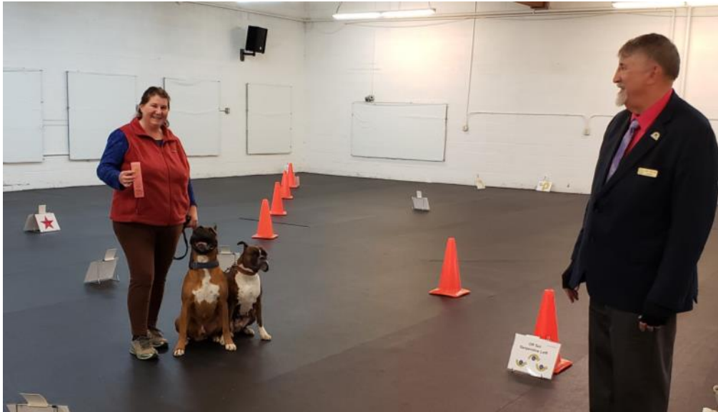
Friday Rally Advanced Pairs