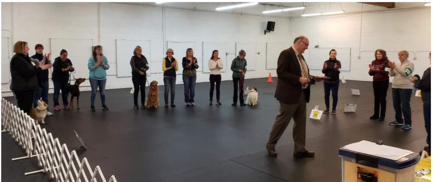
Saturday Novice B Qualifiers