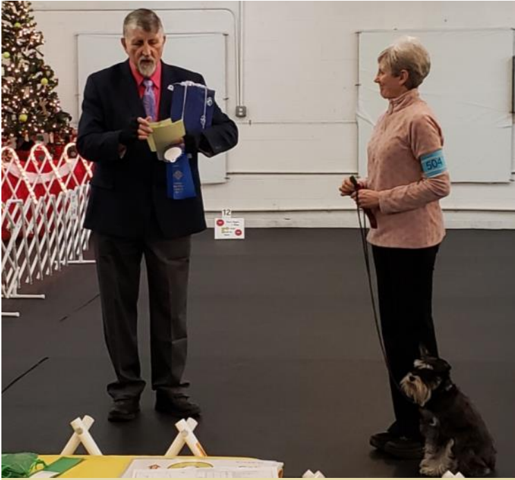
Friday High Triple Qualifier and High Combined