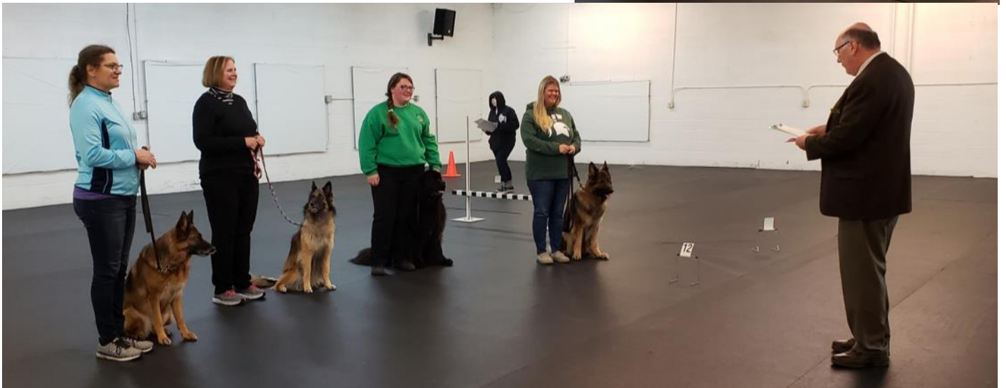
Saturday Rally Advanced Team