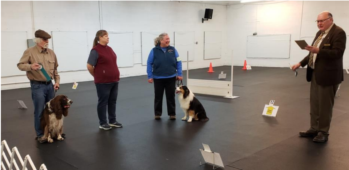
Saturday Rally Advanced A Qualifiers