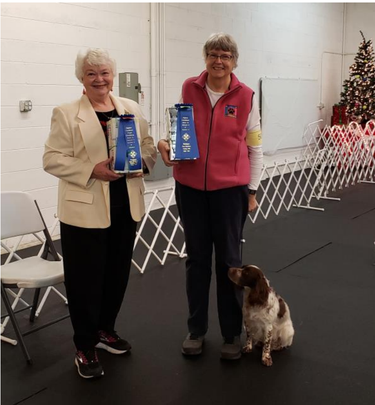
Sunday High Triple Qualifier and High Combined