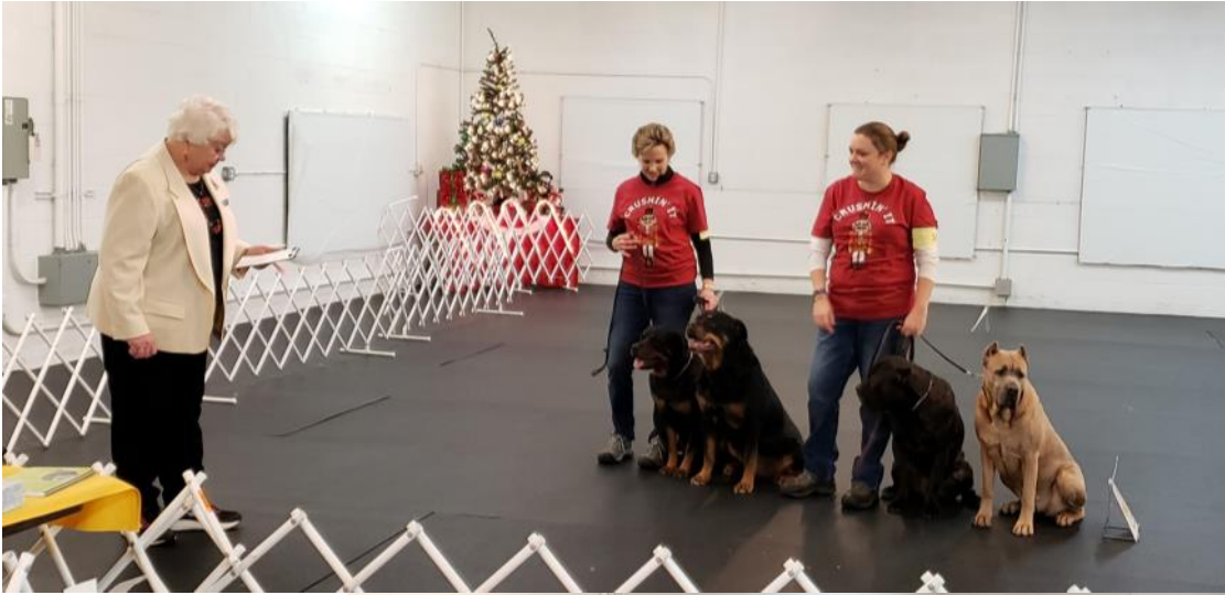
Sunday Rally Novice Team