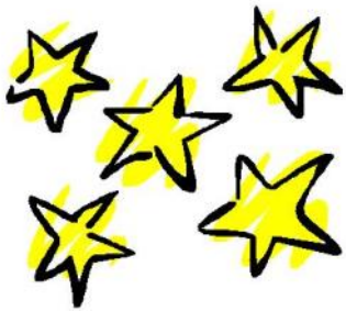
Saturday Rally Novice Pairs