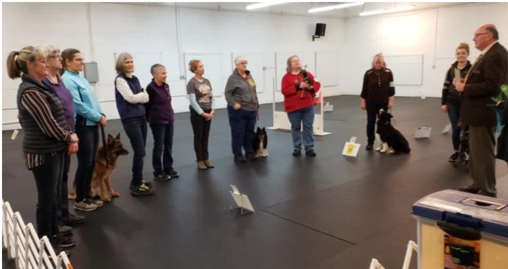
Saturday Rally Advanced B Qualifiers