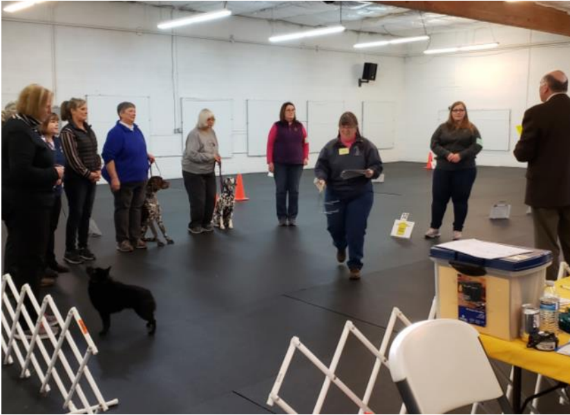
Saturday Rally Intermediate Qualifiers