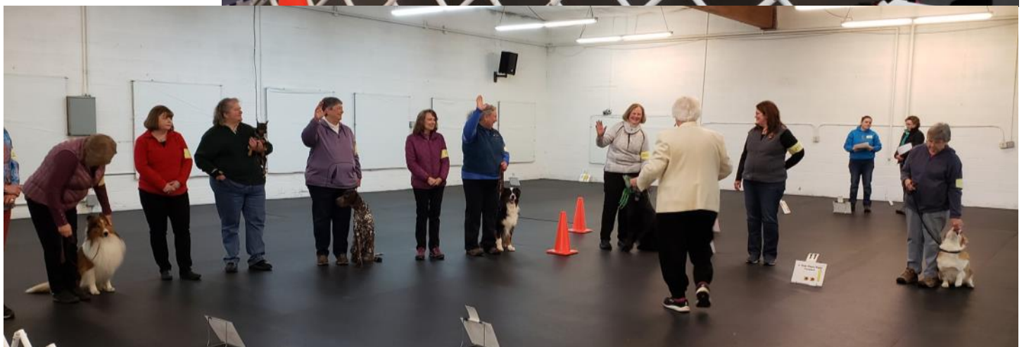
Sunday Rally Intermediate Qualifiers