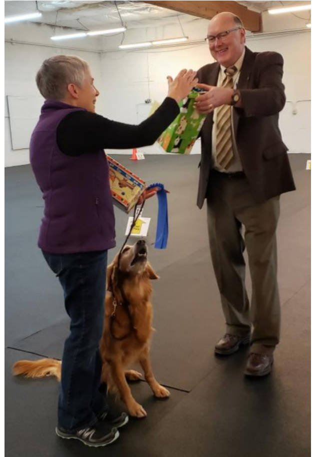
Saturday High Triple Qualifier and High Combined