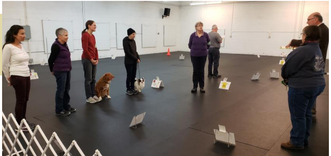
Saturday Rally Masters Qualifiers