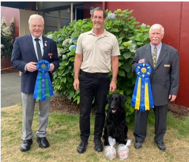
Obedience High in Trial and High Combined Saturday and Sunday