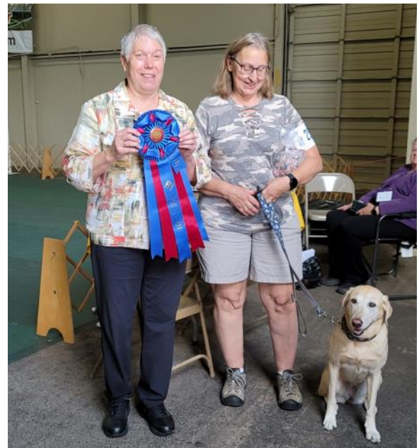
Sunday Rally High Triple Q