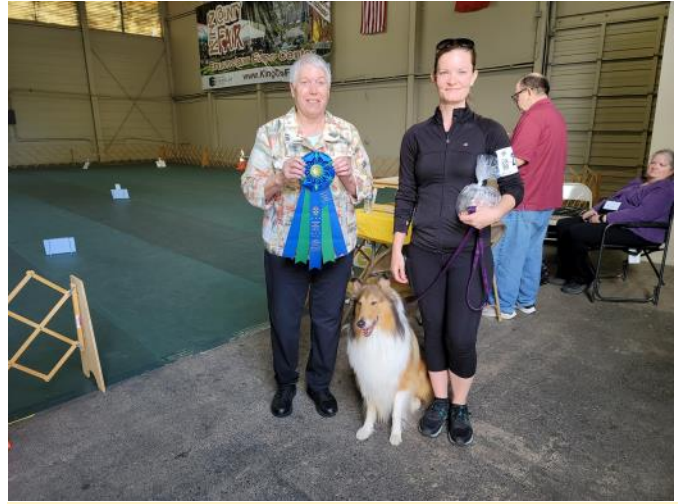
Sunday Rally High Combined