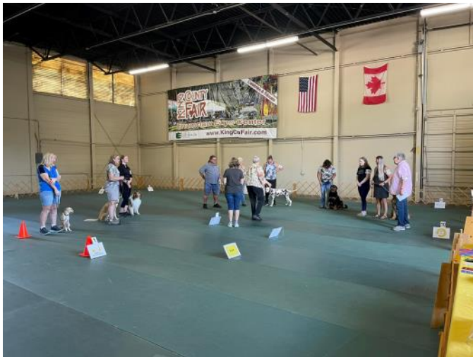
Sunday Rally Advanced B Qualifiers