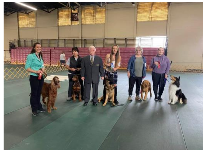
Saturday Beginner Novice A & B Qualifiers