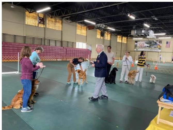
Saturday Utility B Qualifiers