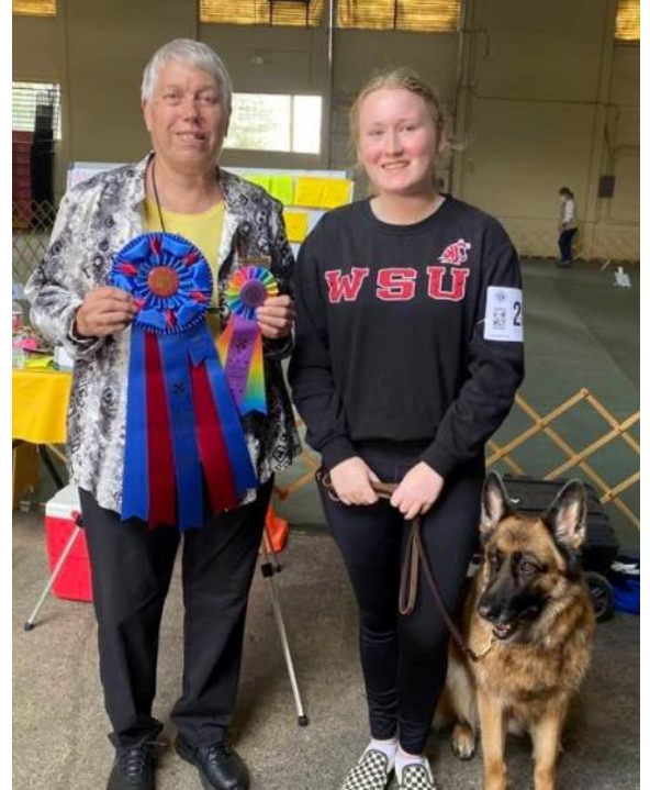
Saturday Rally High Triple Q