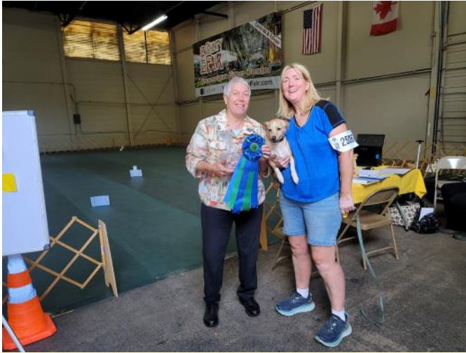
Saturday Rally High Combined