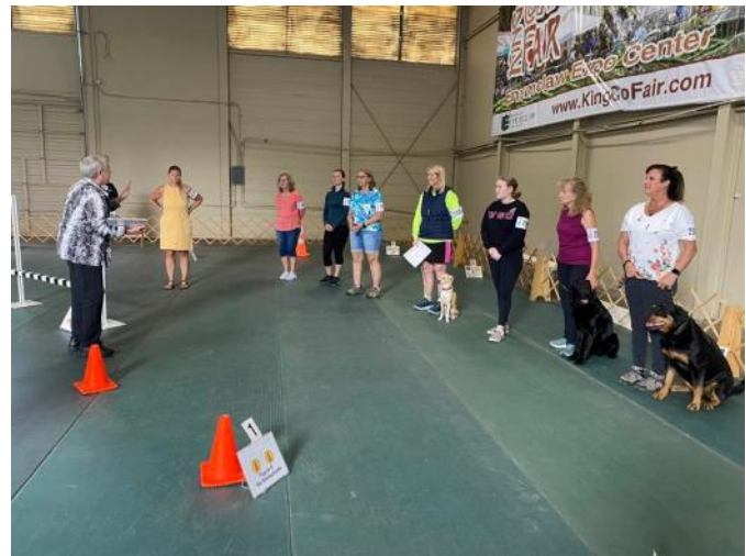
Saturday Rally Master Qualifiers