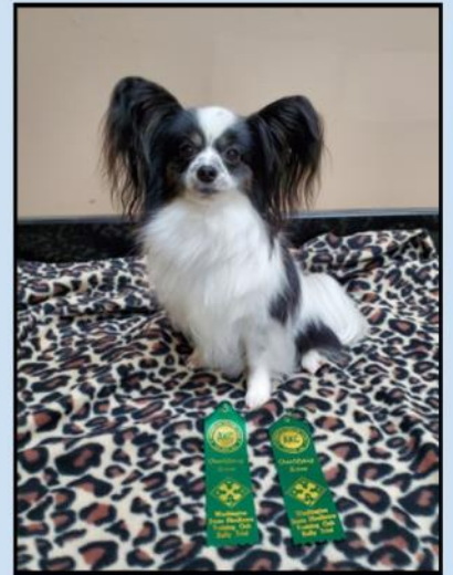
Elsa's first RAE leg with scores of 94 and 96