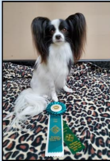
Menta earned her RM6 title with a score of 97