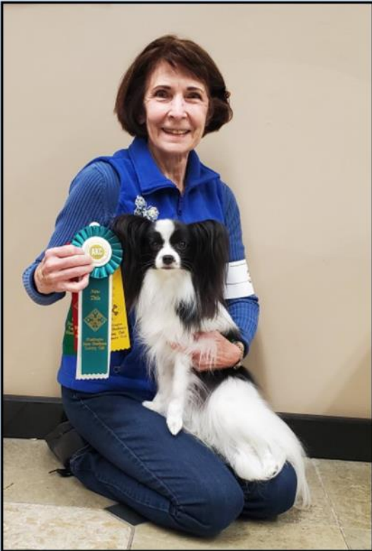
Menta earned her CDX title with scores of 195 and 194.5